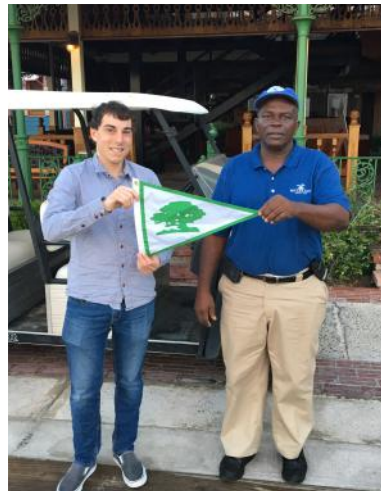
Bitter End Yacht Club Virgin Gorda, British Virgin Islands