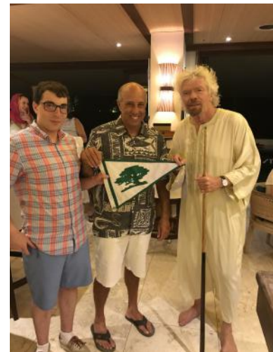
Richard Branson, Necker Island British Virgin Islands.